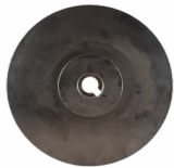
BLAST WHEEL 500-1025