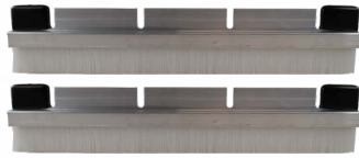
SIDE BRUSH SET 500-1050-S