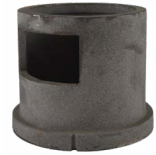
CONTROL CAGE 500-1010